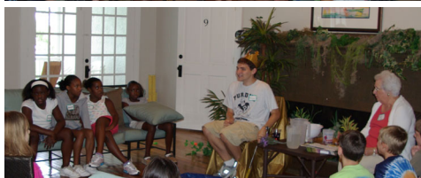
The Boys & Girls Club of South Alabama, Sonny Callahan Branch

(thanks to Charlotte Naylor, photographer)