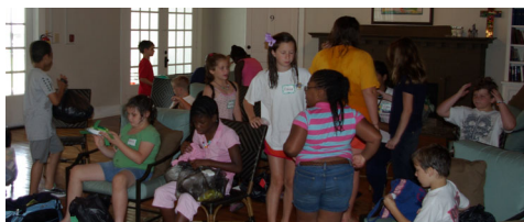
Photos from the Richard Mighell Camp at Baytreat July 7-10