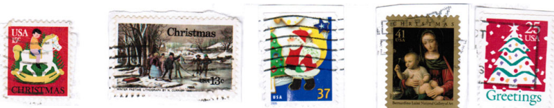
No CHRISTMAS — Madonna or Secular